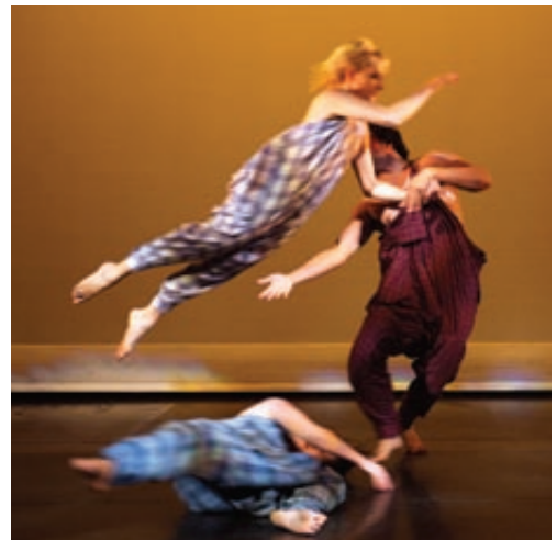
CONTEMPORARY "Not What I Do"