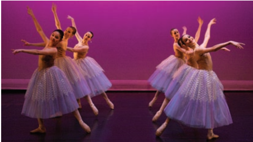
YOUTH Mt Eden Ballet Academy