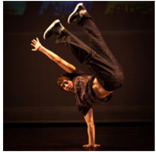
HOT SHOWCASE Hip Hop Dancer