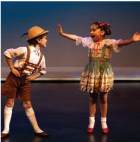
YOUTH Mt Eden Ballet Academy