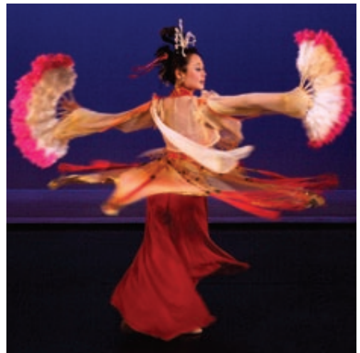
WORLD SHOWCASE Chinese Fan Dancer