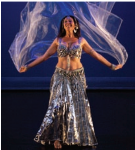
WORLD SHOWCASE Belly Dancer