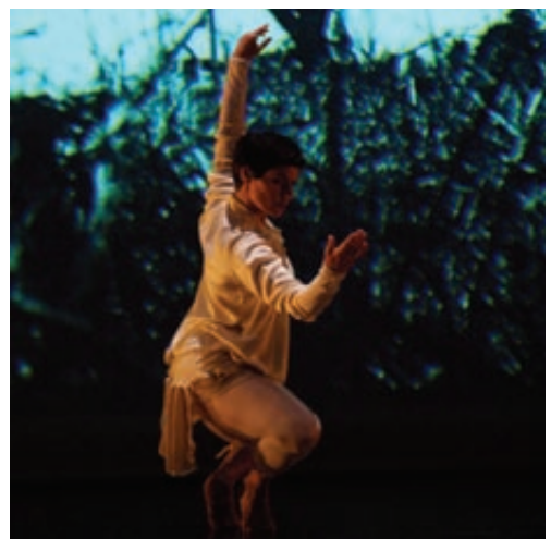
CONTEMPORARY "Old Yeller"