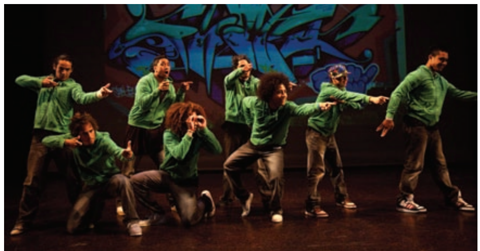
HOT SHOWCASE Hip Hop Dancers