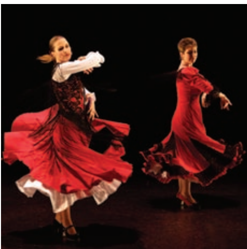
LOUD SHOWCASE Flamenco Dancers